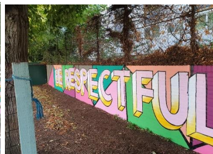
The selected area for the new Mud Kitchen, shown in the centre with the reading wigwams before the Wetland Centre trip.

Now it was time to build the vision, but there was one problem. There was hardly any money for the build. I had to source the materials for free, but luckily I do like a challenge.