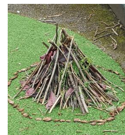
One of the creations made by children days, weeks and months after their trip to the Wetland Centre.

All the pupils from classes 1 to 6 visited the Wetland Centre and were introduced to Ava's story. Following this, the children's attitudes to their school surroundings changed. Every single day we saw children engaging with activities they were introduced to at the Wetland Centre. They were twig peeling, building homes for insects, digging stones out of the raised beds, building pretend fires and looking at the different leaves. We have also had a woodlouse zoo and a snail zoo and they had a pretend shop set up where you could buy sticks and pay with stones and vice versa. All these activities were lovely to see, but my thoughts lied with the safety aspects as we have a large amount of foxes and cats that used the raised beds as toilets, which is the only place pupils had available to them that was not the concrete playground.