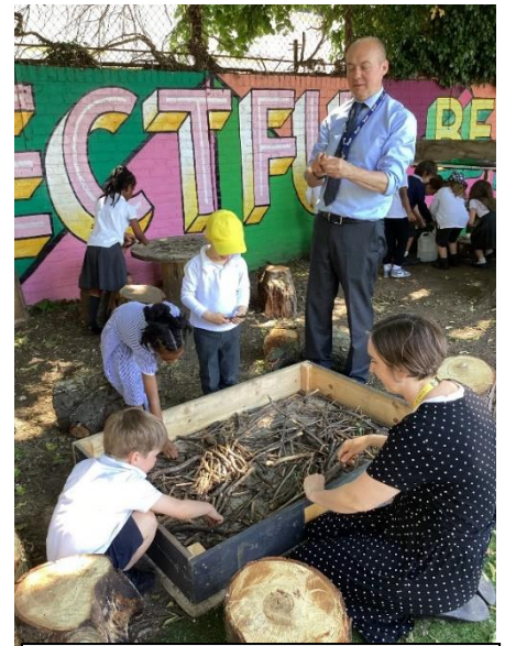
The twig and stick area inspired by the challenges at the Wetland Centre.