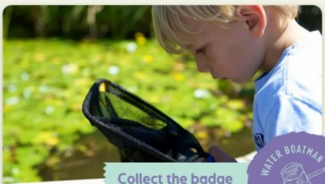
Collect the badge