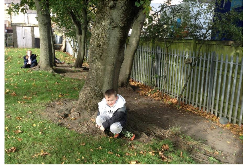
Enjoying a quiet moment in autumn term!