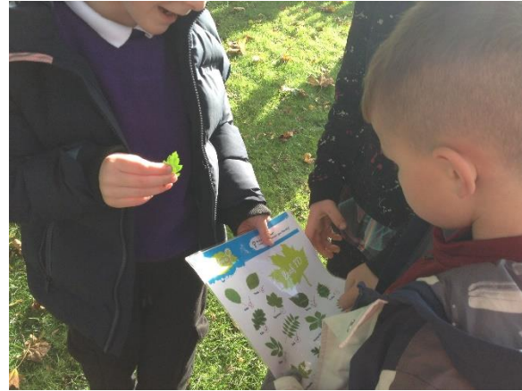
Identifying trees in our school grounds.